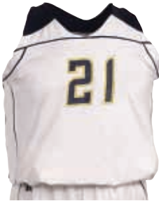
Shown with lettering options