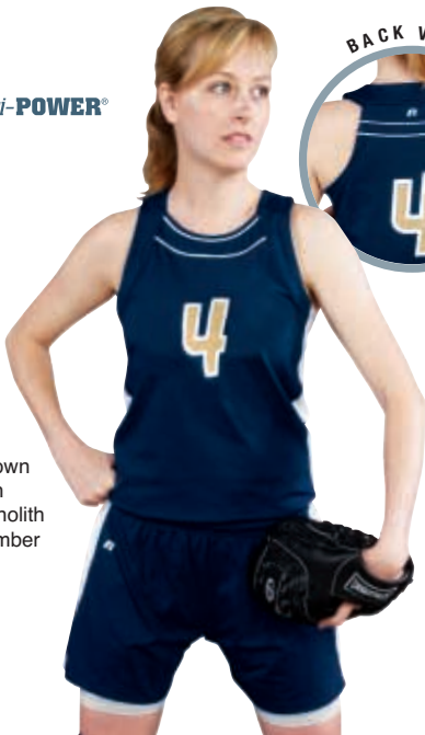
Shown with Monolith Number